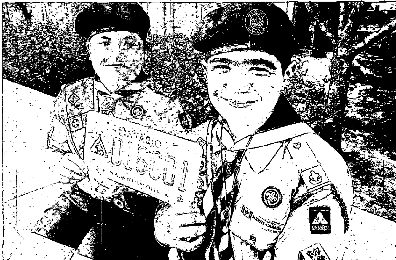
1st Pickering Scouts assisted the Ministry of Transportation when our licence plates were unveiled at a Queen's Park ceremony this past summer. Since then, nearly 400 Scouters have taken this opportunity to promote Scouting in Ontario

* In 1996 Blue Springs and Training Operations were accounted separately.